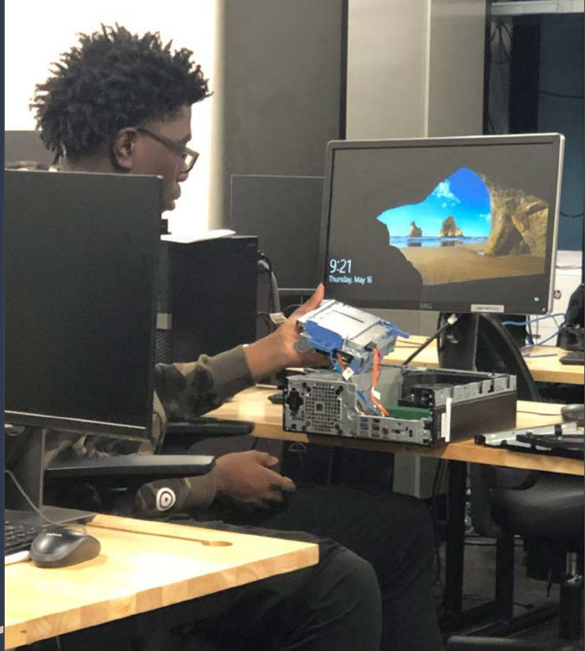
HUM II student developing PC hardware repair skills as part of a paid microinternship at Per Scholas, Bronx, NY