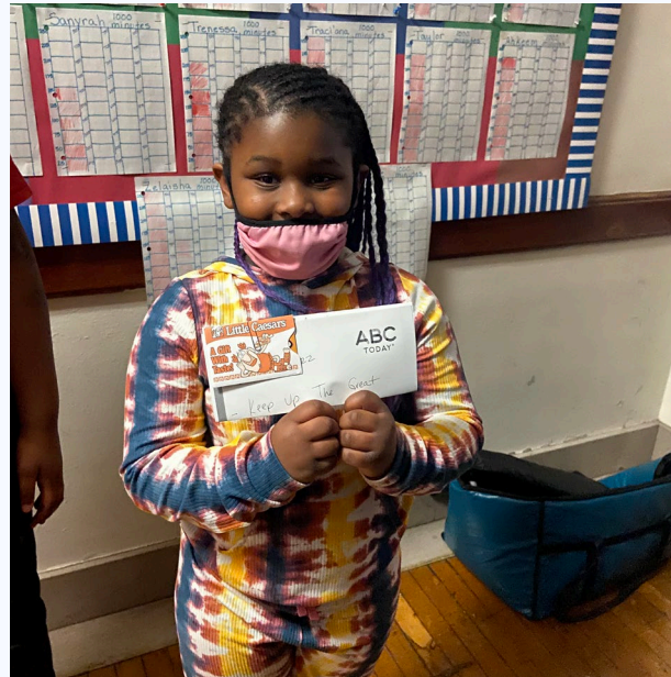
INDIVIDUAL STUDENT CELEBRATIONS